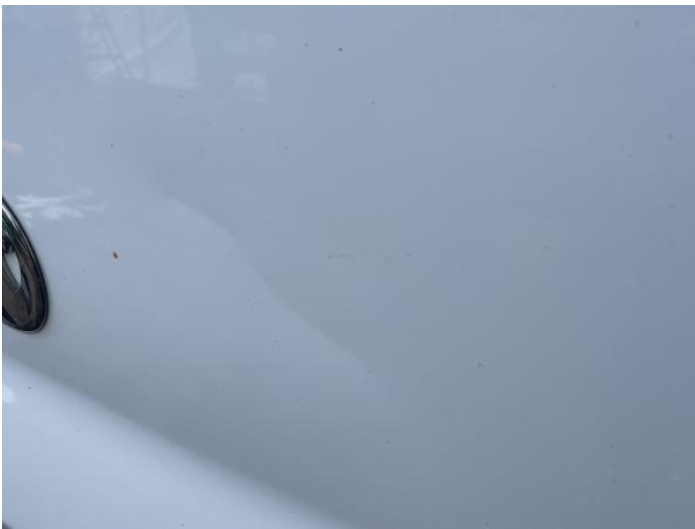
5: Tailgate Dented Over 30mm