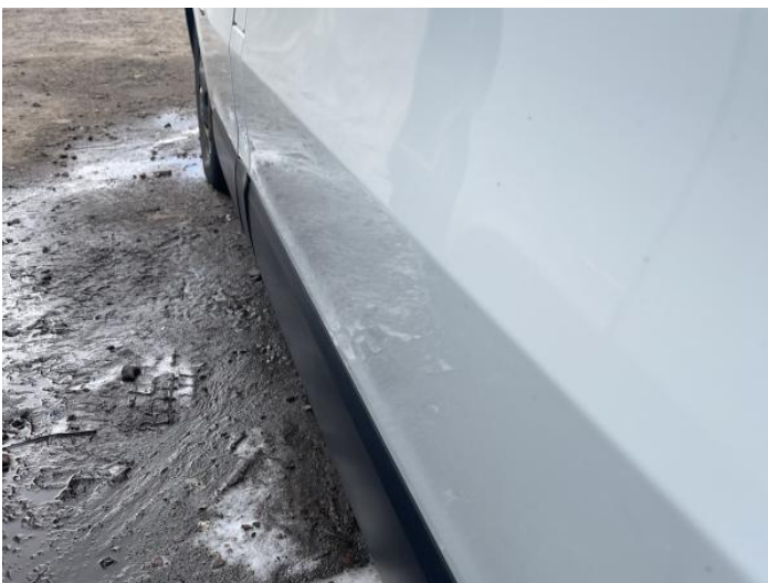
7: Door nsr Dented Over 30mm