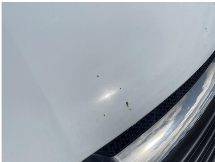
1: Bonnet Rusted Over 5mm