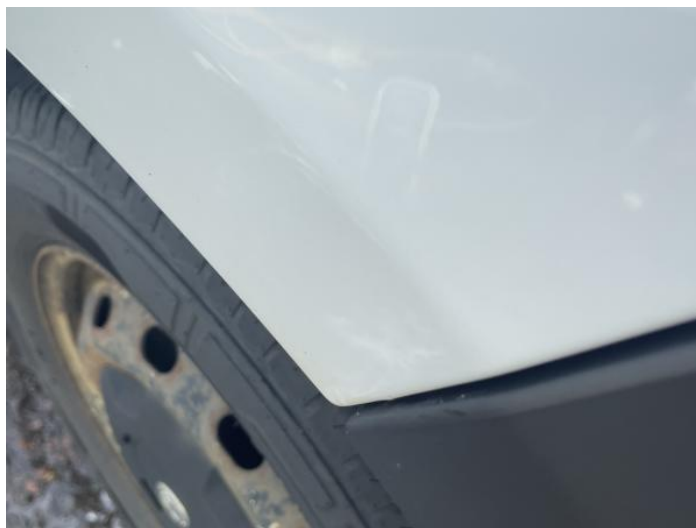
2: Wing of Rusted Over 5mm