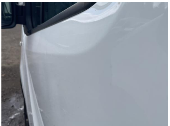
8: Door nsf Dented Over 2 UpTo 10mm