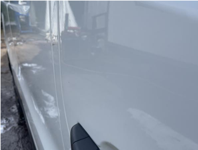
3: Door osf Dented Over 2 UpTo 10mm