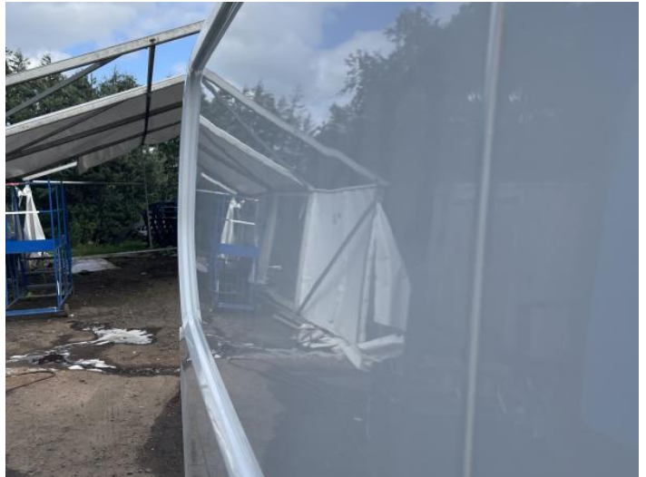
4: Qtr Panel osr Dented 2 Or Less UpTo 10mm