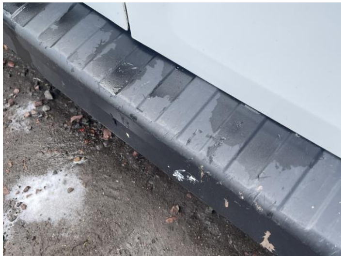
6: Bumper Rear Moulding Scuffed (Unpainted) UpTo 100mm