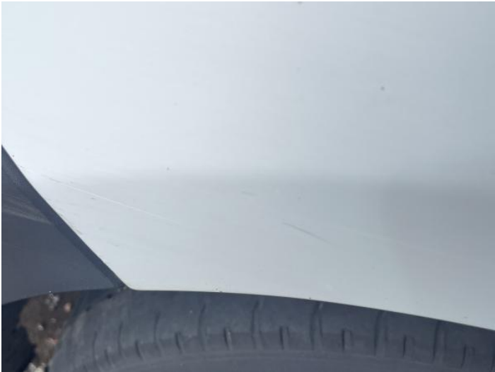
9: Wing nsf Rusted UpTo 5mm